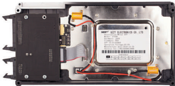
ZT598J in 56xx/58xx housing with SDC interface board