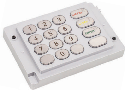
USB variant mounted in a 66xx compatible housing with USB interface board