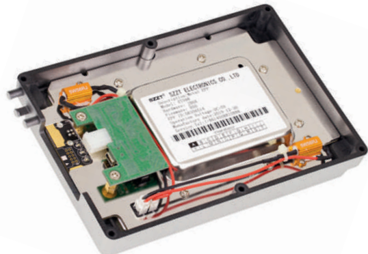
ZT598J in 66xx housing with USB interface board