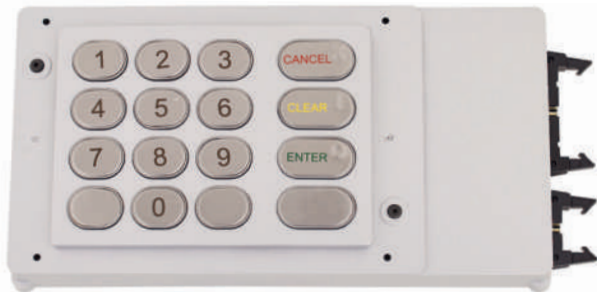
SDC variant mounted in a 56xx/58xx compatible housing with SDC interface board